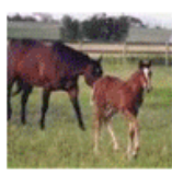
Horse Health Products