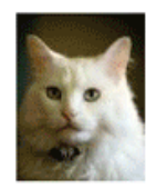
Cat Health Products